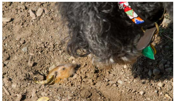
Cute, but a nuisance.

A few volunteers have been filling in the gopher holes with field dirt in hopes that no dogs or people will trip in them as has happened in the past. (One dog broke a leg badly.) Feel free to pick up a shovel and join in the process. There is dirt at either end of the dog park – bring a shovel!